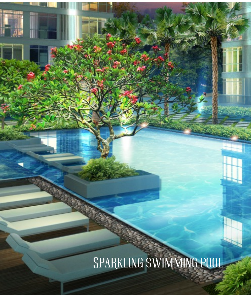
SPARKLING SWIMMING POOL