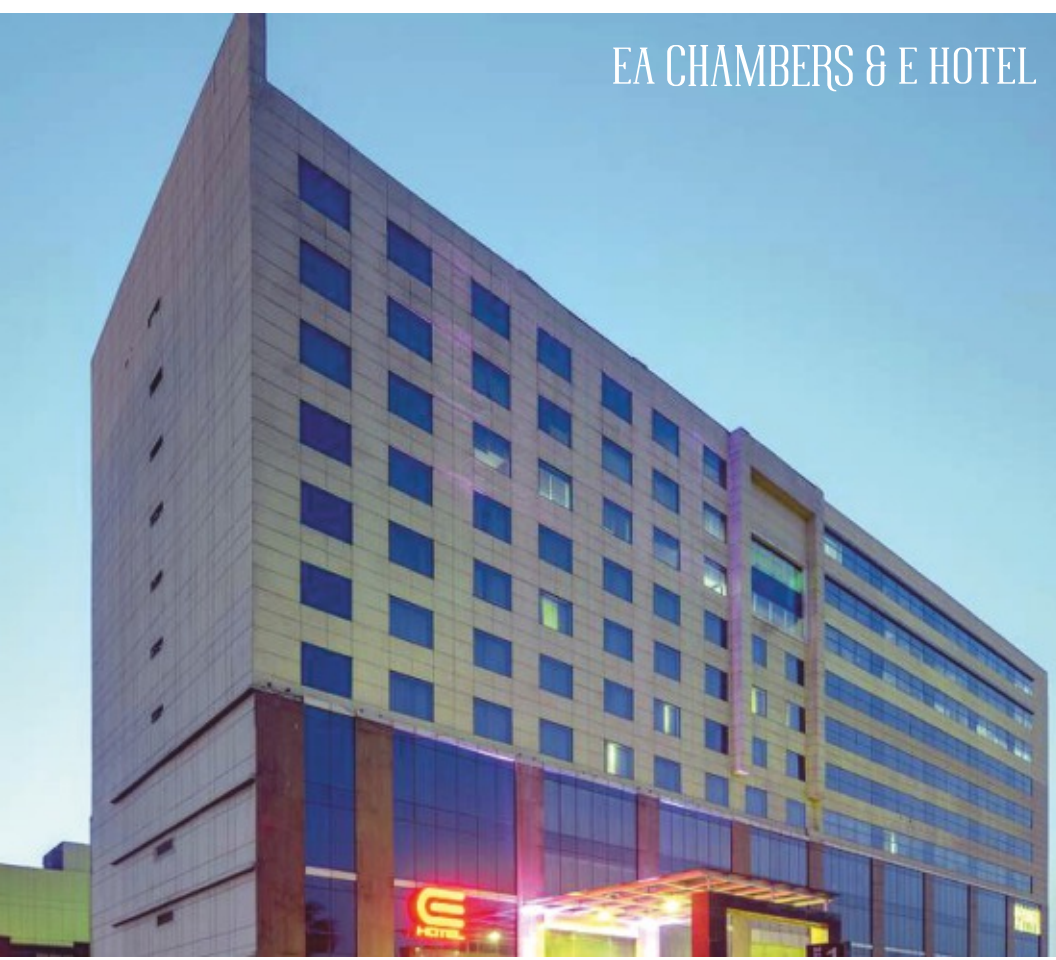
EA CHAMBERS & E HOTEL