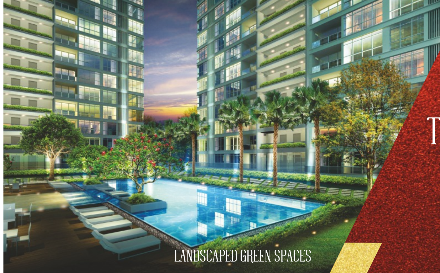
LANDSCAPED GREEN SPACES