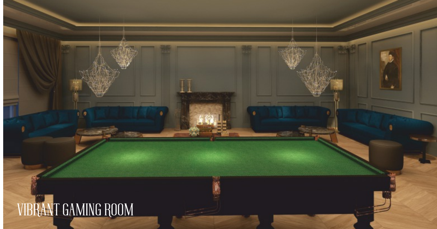
VIBRANT GAMING ROOM