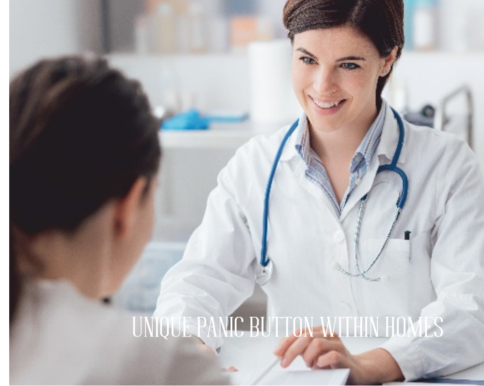
UNIQUE PANIC BUTTON WITHIN HOMES