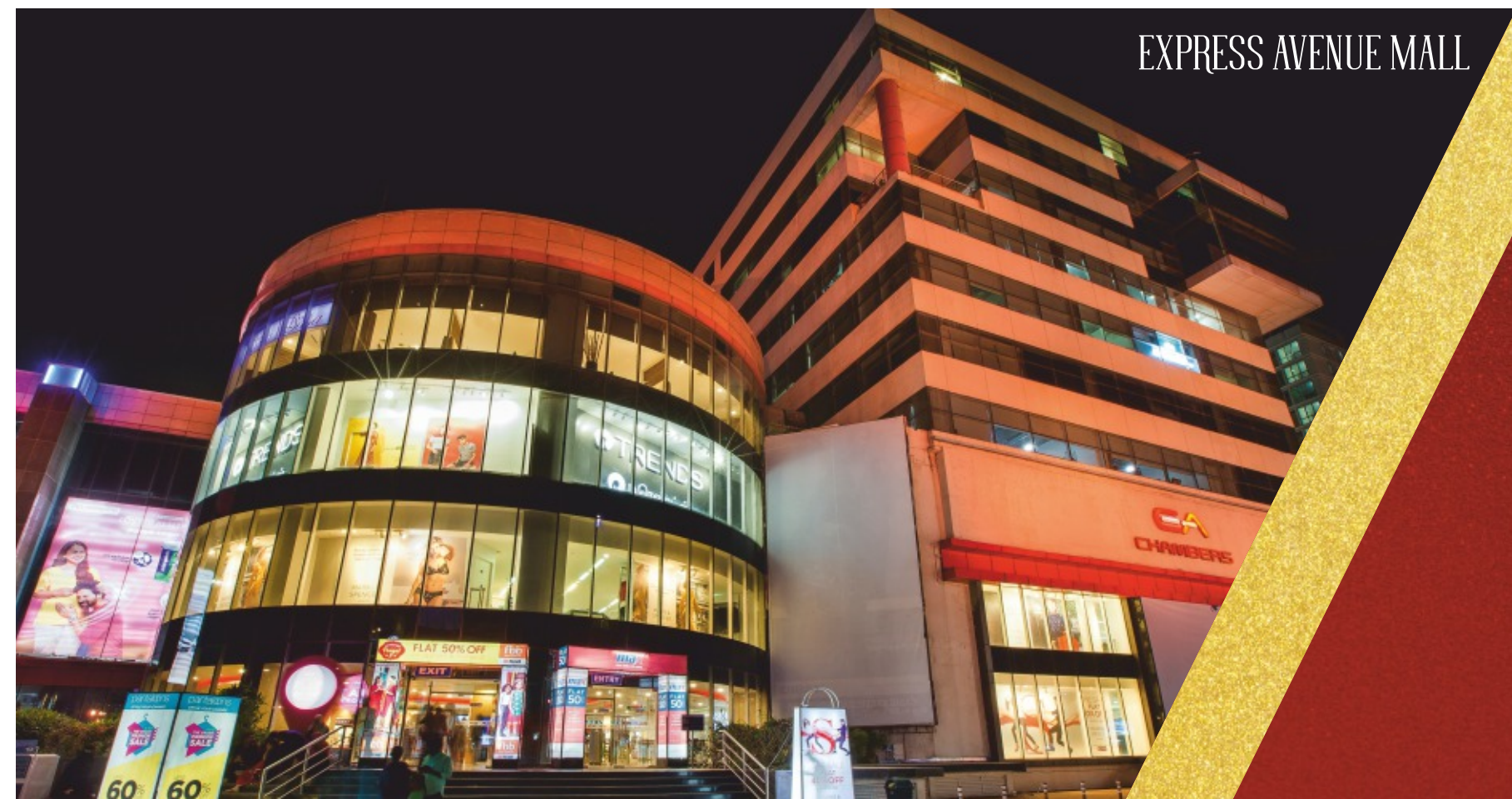
EXPRESS AVENUE MALL

Masterfully designed & conceptualised by the globally renowned DP Architects Of Singapore, E Residences would be a significant part of a larger development 'Express Estate' making it the first of its kind integrated 'Mixed-Use Lifestyle Complex' comprising of a high end retail mall 'Express Avenue', commercial offices 'EA Chambers' & a boutique hotel 'E Hotel', all within its meticulously planned self-contained grounds. Here you can live, work, play, shop, relax, indulge, celebrate and get away from everything without missing out on anything!