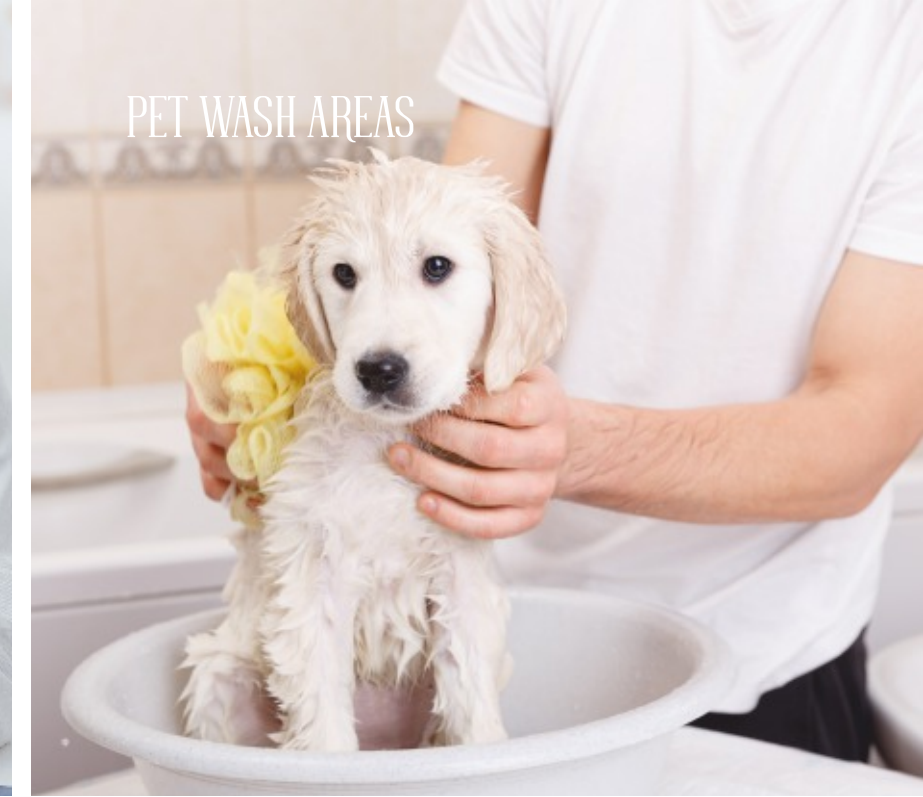
PET WASH AREAS