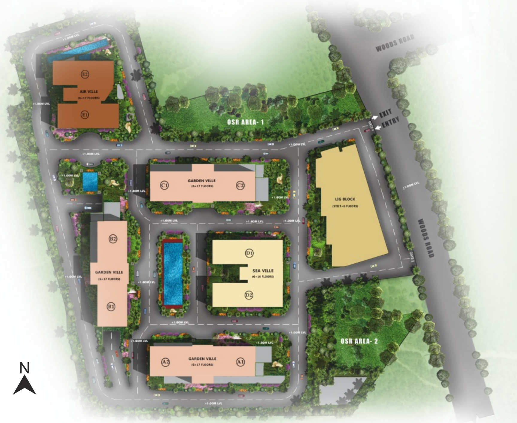
Garden Ville (Block-A,B,C) Sea Ville (Block-D) Air Ville (Block-A,B,C) LIG Block