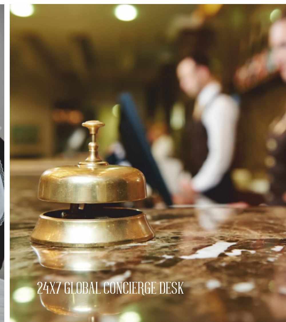
24X7 GLOBAL CONCIERGE DESK